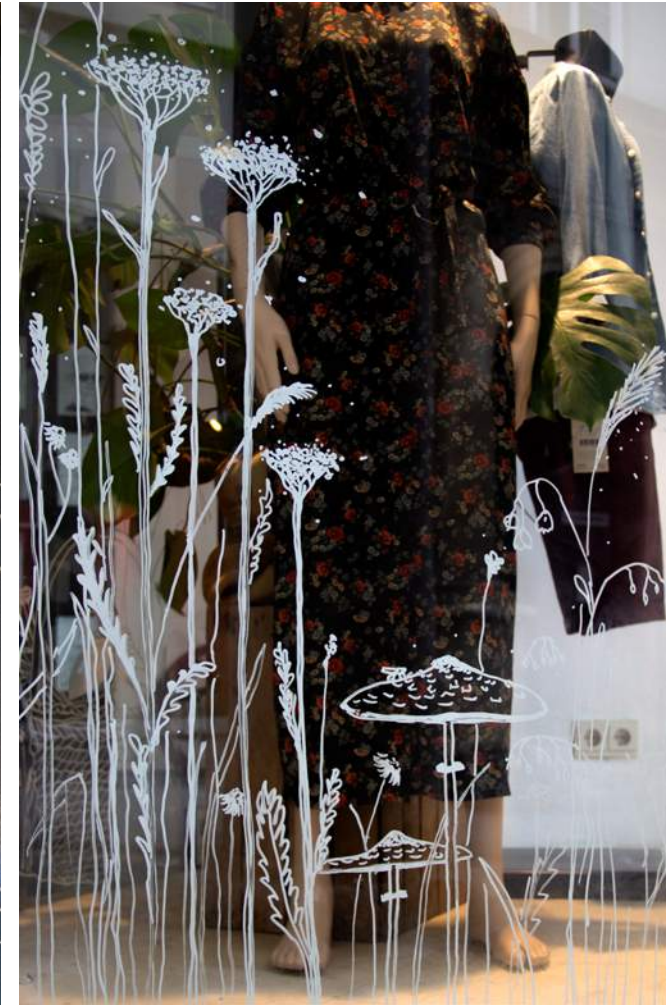
Aeijst Gin Destillery & Apflbutzn Store | Organic & Preloved Fashion | Austria | 2021