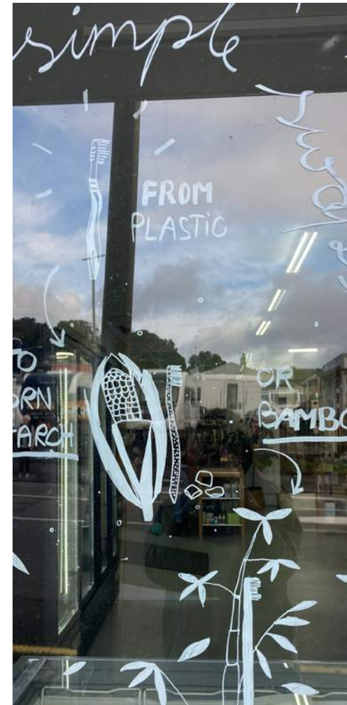
Down to Earth Organic Store | New Plymouth | New Zealand | 2023