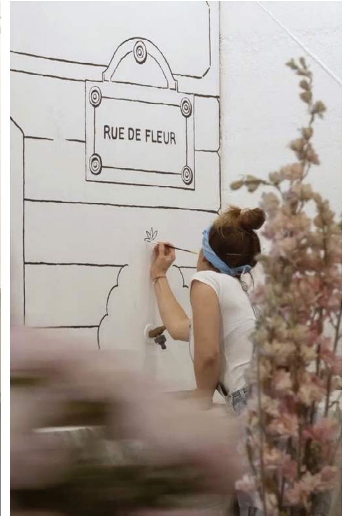
The Flowercart | New Plymouth | New Zealand | 2020